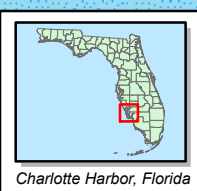
Charlotte Harbor, Florida

This water quality map was generated using all available data on the Charlotte Harbor NEP Water Atlas. Maps are generated using spatial interpolation in which areas with known data values are used to estimate the values for unknown areas. Using a high number of evenly spaced sampling locations will increase the accuracy of the estimations. The inset map above shows the sampling locations used to create this map.