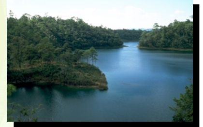
Fourth-order streams are large.

Streams are ordered according to their position in the watershed. The smallest streams have a "1" and are called "first-order" streams.