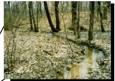
First-order streams are small.