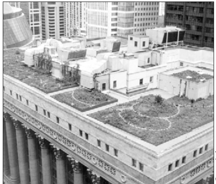
City of Chicago

Milwaukee – City funding is paying off in reduced runoff and improved water quality through downspout disconnects and several greening programs.