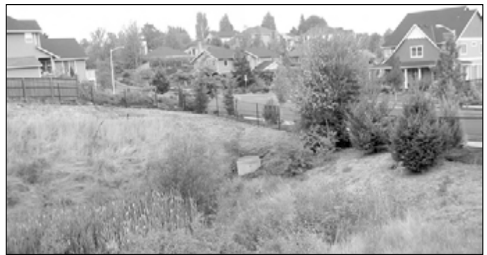
James R. Fazio

Community policy can make the difference between ugly, single-use stormwater basins and those that provide not only function but open space, a refuge for wildlife, and a touch of beauty.