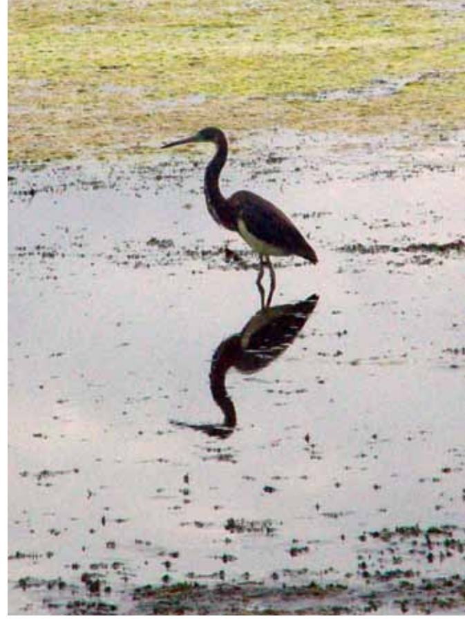
Figure 5. Tri Color Heron resting on matted submersed vegetation in Orange Lake, FL, for foraging activities.

Hanson, A.R. and J.J. Kerekes. 2006. Limnology and aquatic birds. Proceedings of the fourth conference working group on aquatic birds of Societas Internationalis Limnologiae (SIL). Springer, Dordrecht, The Netherlands.