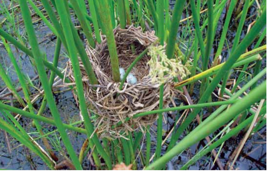
Figure 3. Red Winged Blackbird utilizing emergent vegetation on Lake Tohopekaliga, FL, for nesting site.

abundance of aquatic plants, (2) birds that are negatively affected by an abundance of aquatic plants, and (3) birds that have no relationship to the total abundance of aquatic plants but require the presence of a particular plant type for completion of their life cycle. However, these are loose generalizations and individual species of aquatic birds can transcend these plant groupings depending on the given lake system and the bird's life history requirements.