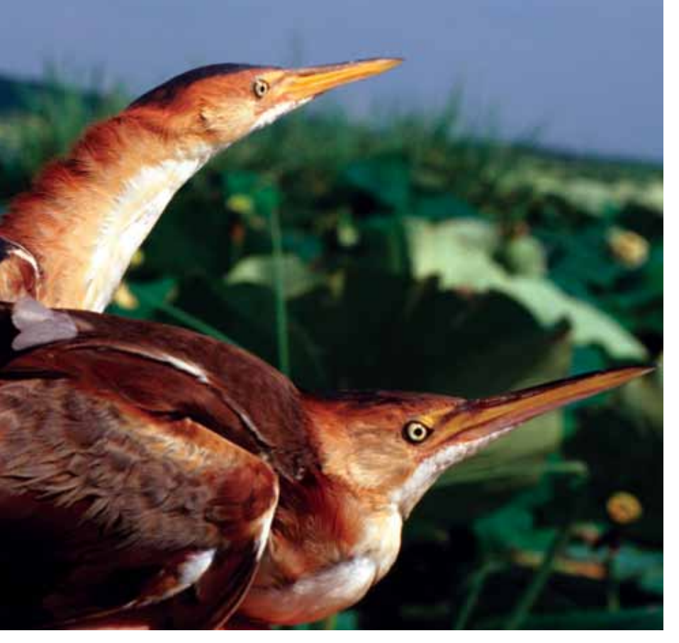
Figure 4. Least Bitterns utilizing floating leaf vegetation on Orange Lake, FL, for breeding activities.

Many wading birds also fall into this group and do well in lakes regardless of the amount of aquatic plants, but one factor that may limit the success of these wading birds is the availability of water shallow enough for them to forage for food. Wading birds that inhabit lakes regardless of the abundance of aquatic plants include great blue heron ( Ardea herodias ), great egret ( Ardea alba ), snowy egret ( Egretta thula ), little blue heron ( Egretta caerulea ) and tricolored heron ( Egretta tricolor ) (Figure 5).