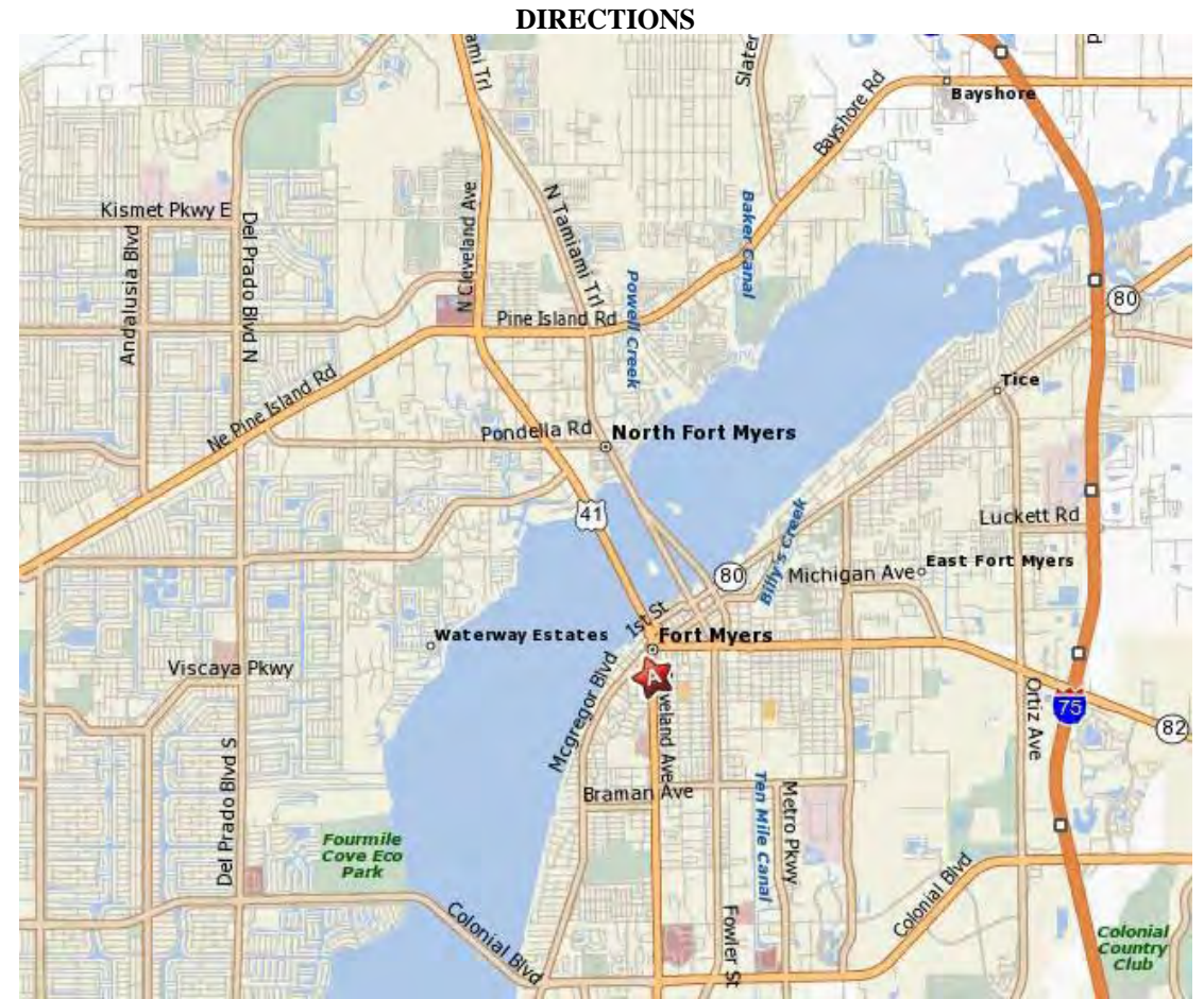
Simplified Directions: For more detailed directions, please consult a mapping program.