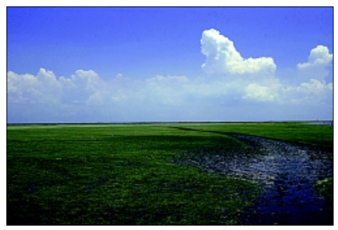
Dense hydrilla mat in a south Florida waterway

Because of its aggressive growth rate, never transplant hydrilla from waterway to waterway, and please clean all boats and trailers, live wells, and diving gear of plant material before entering or leaving a waterbody. Possession of hydrilla is illegal in Florida without a special permit.