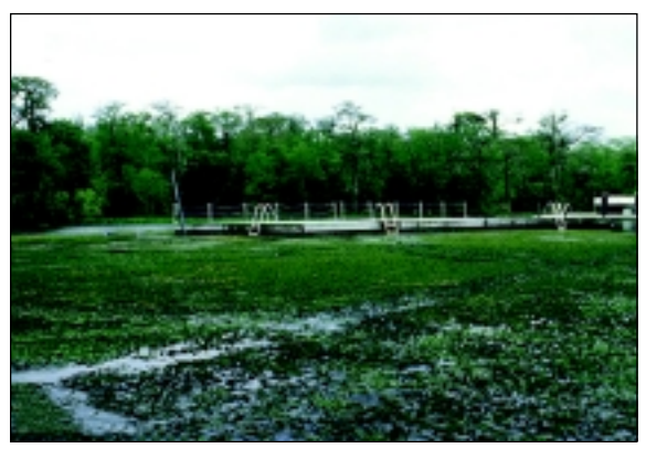
Hydrilla at Wakulla Springs, Florida

Hydrilla - This submersed plant native to Africa and Southeast Asia is a major aquatic weed throughout most of the world's warmer climates. Hydrilla was introduced into Florida in the early 1950s and by the early 1990s occupied more than 140,000 acres of public lakes and rivers. Intensive interagency management has reduced the above ground portions of hydrilla to under 50,000 acres. However, once established, hydrilla produces reproductive tubers numbering in the millions per acre in the soils of Florida waterways. These tubers still impact nearly 140,000 acres and represent hydrilla's regrowth potential if not continually managed immediately after sprouting. Researchers have not discovered methods to prevent or minimize tuber formation.